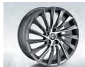
55E 18" sports turbine-design alloy wheels with dark finish (standard on QV)