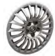
420 16" Wheel covers (standard on 1.4 TB Giulietta)