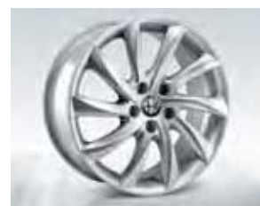
420 17" sports turbine-design alloy wheels (standard on Distinctive)