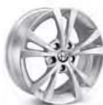
432 16" sport alloy wheels (standard on 1.4 TB MultiAir & JTDM Progression)