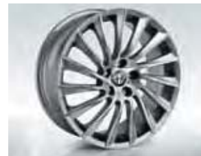
435 18" sports turbine-design alloy wheels (packaged with Sportiva Pack)