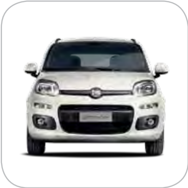
296 Ambient White - Pastel