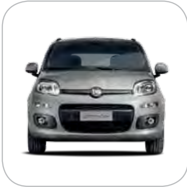
565 Active Grey - Metallic