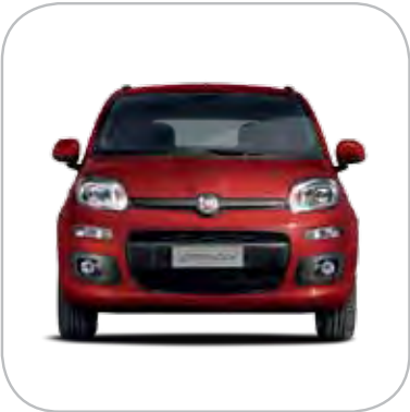
289 Italian Red - Non standard Pastel