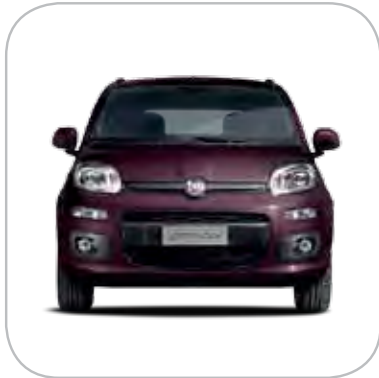
184/B Violet Purple - Metal-flake