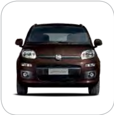
833/A Cozy Brown - Non-standard pastel