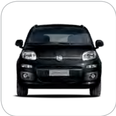
601 Seduction Black - Non-standard pastel