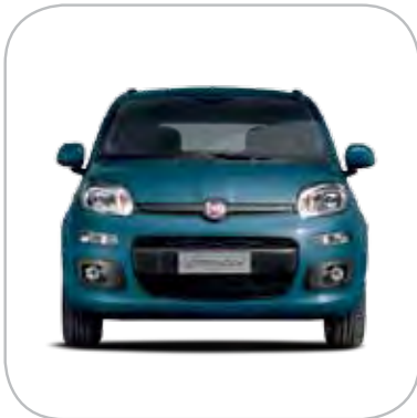
403/C Sweet Dreams Turquoise - Non-standard pastel