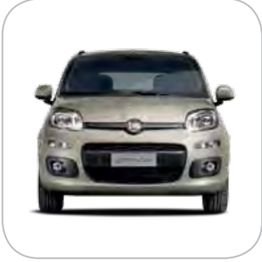
715/A Sweet Candy Beige - Non-standard pastel