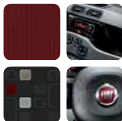
125 Rubik fabric Red / Grey Grey dashboard fascia