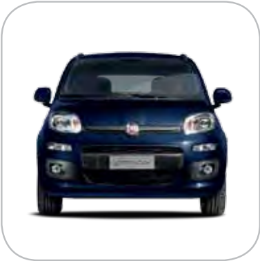
567/A Mediterranean Blue - Metallic