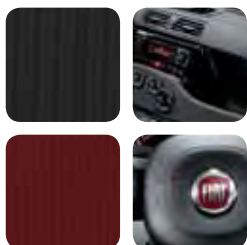
107 Easy Fabric Tricot Grey / Red Anthracite dashboard fascia