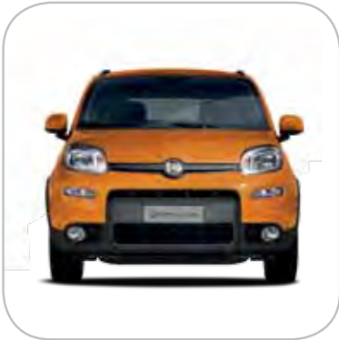
516/A Sicilian Orange - Non-standard pastel