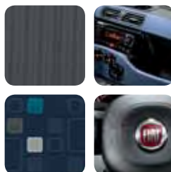
319 Rubik fabric Grey / Blue Blue dashboard fascia